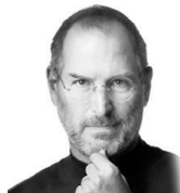
Steve Jobs American entrepreneur and inventor (1955-2011)

INNOVATION DISTINGUISHES BETWEEN A LEADER AND A FOLLOWER.