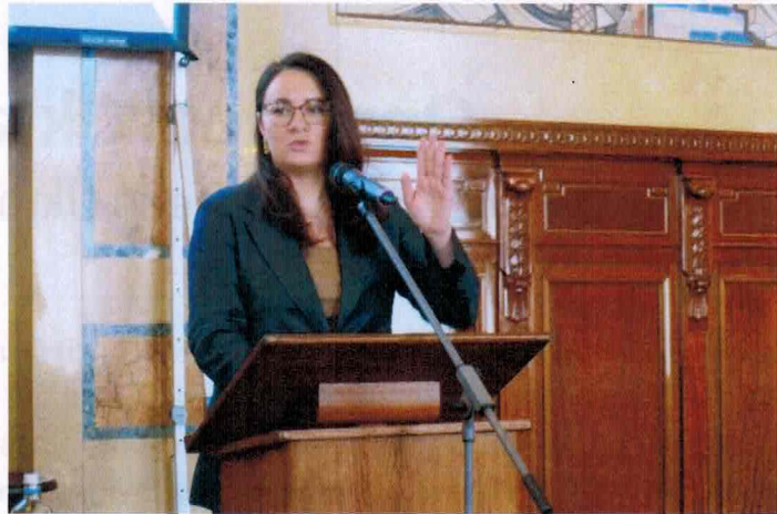
Yulia Svyrydenko, Ukraine's First Vice Prime Minister and Minister of Economic Development and Trade, speaking at ODU's 2022 Ukraine Reconstruction Business Forum.

As part of its outreach efforts, Information on Ukraine and on ODU's and other Dutch initiatives on Ukraine are shared via its LinkedIn and Facebook channels. ODU's Board and associated members – including chairman and first Dutch ambassador in Kyiv Robert Serry, and Board of Trustees chairman and former Defence Minister Joris Voorhoeve – are regularly giving media and public presentations.