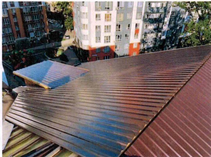
Fully reconstructed roof of the building at Novooskoska 40, Irpin, ODU's first reconstruction project.

The Humanitarian table has been instrumental in coordinating and facilitating relief activities of Dutch humanitarian organizations that are active in Ukraine. Directly at the start of the war, ODU helped to arrange the transport of Ukrainian refugees from the Polish border to the Netherlands. ODU also launched an emergency assistance project to help associations of house owners in Ukraine to rebuild the roofs on their apartment buildings before the winter sets in. Thanks to fundraising and sponsoring, the first two projects in Irpin near Kyiv are now almost completed, with more to follow as funding allows. ODU is now setting up a representation in Kyiv to support this and other humanitarian operations, and to enhance our general networking role with Ukrainian counterparts.