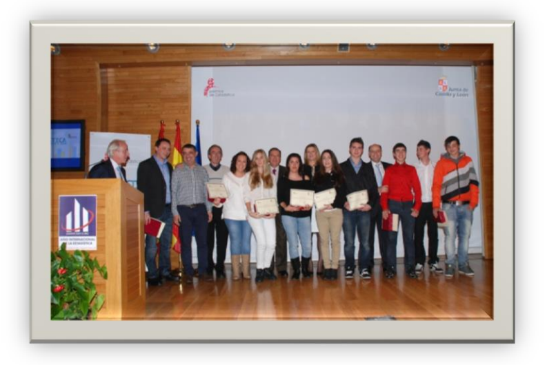
Winners of the Statistical Office of Castilla y León's XII School Competition on Statistical Works receive their rewards at a special ceremony.

February the XII School Competition on Statistical Works. The competition was open to students in secondary and high education from Castilla y León. On November 22, the competition awards ceremony was held and attended by statistical and educational authorities and the winners along with their family members and friends. The first-place award in the secondary-education category was awarded to the work titled "Where Bierzo is called Cabrera (Donde el Bierzo se llama Cabrera)", which was presented by IES from Puente de Domingo Florez (León). Politécnico de Soria was the winner in the high-education category for its work titled "Do we have young, healthy habits? (¿Seguimos los jóvenes hábitos saludables?)." During the awards ceremony, the significance of 2013 as the International Year of Statistics was highlighted as was the importance of statistics in our society—a fact that students had established through their works. <u>Click here to view the winning works</u>.