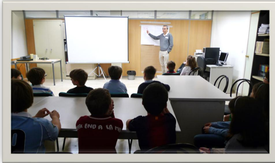
Youngsters learn about statistics at the Aragonese Statistics Institute’s Open Doors Day