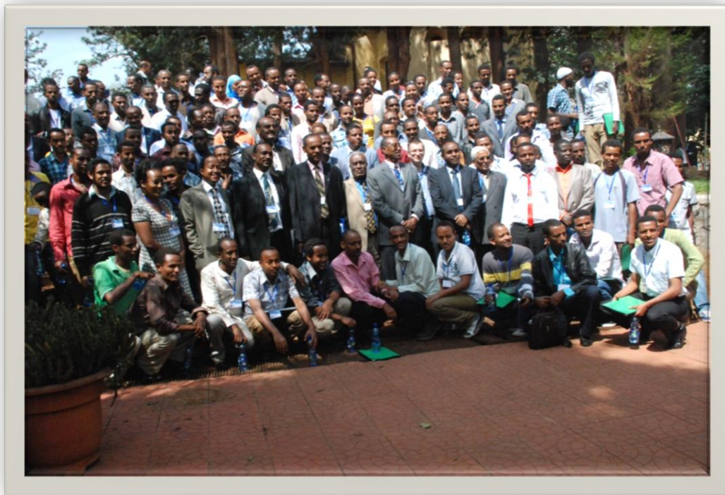
Some of the 200 people who attended Ethiopia’s International Year of Statistics event gathered for this photo.

Ethiopia —Through the joint efforts of the Ethiopian Statistical Association , the Statistics Department of Jimma University , and the Flemish Interuniversity Council—University Development Cooperation (Belgium), more than 200 participants traveled to Jimma University from all over the country for a conference themed, “Statistics in Ethiopia: Emerging Opportunities, Challenges and Prospects”. As the photo below show, the conference was a big success!