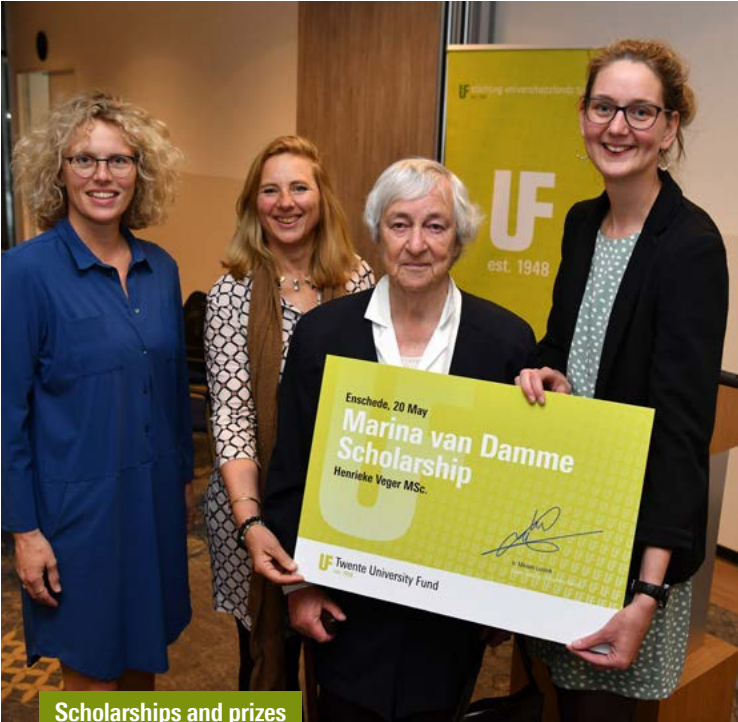
Scholarships and prizes