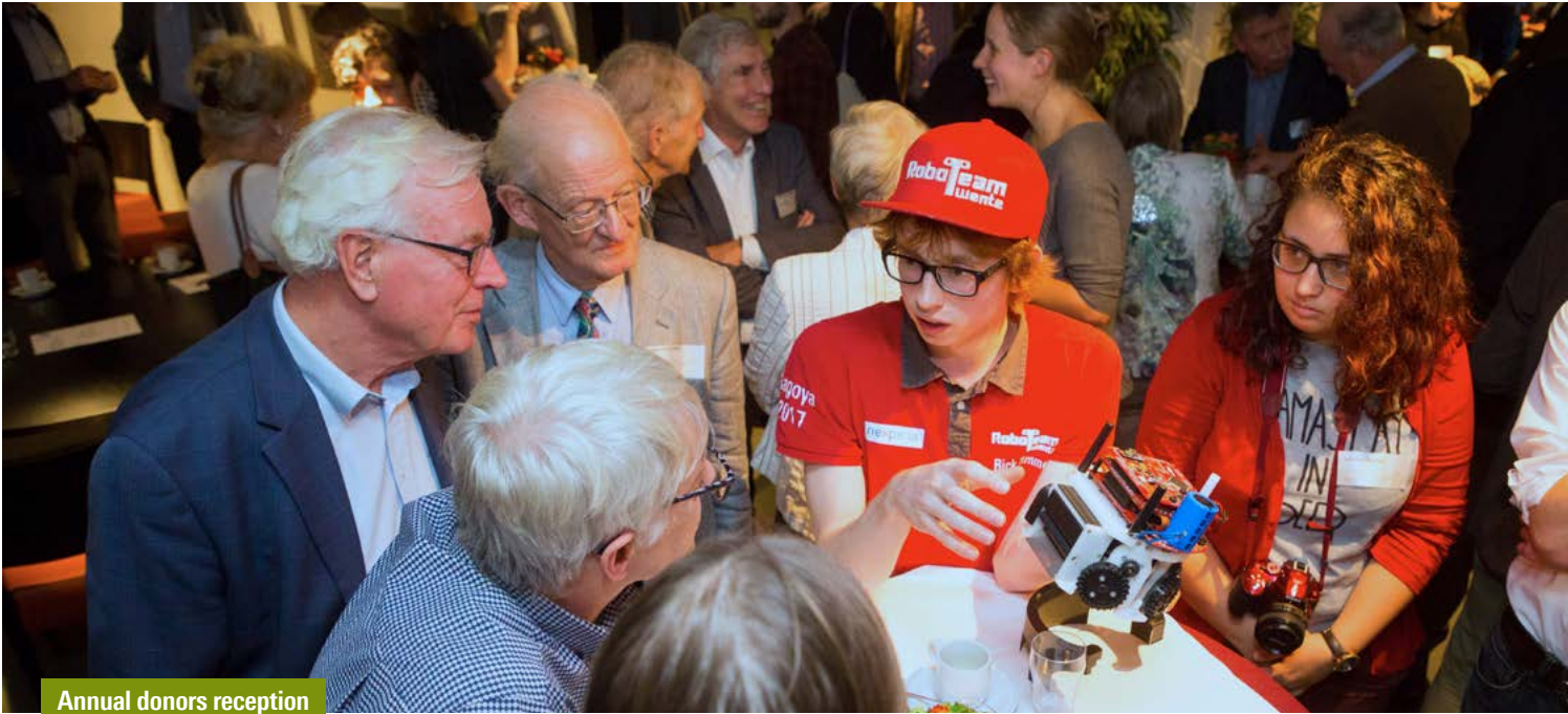
Annual donors reception