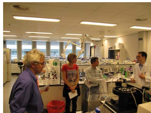
Device training CTCTrap members at Twente University.

The development of the CTC apheresis device for trapping circulating tumor cells (CTCTrap) from the blood circuit of cancer patients is progressing nicely. LEUKOCARE established a coating matrix (CTC Trap matrix) to couple EpCAM-specific capture molecules and demonstrated the binding and elution of cells derived from tumor cell lines expressing EpCAM under flow conditions. The CTCTrap device was down scaled to a bench scale size model to perform the cell binding and elution using realistic rheologic parameters. The compatibility of the CTCTrap bench scale model with blood spiked with EpCAM positive cells was demonstrated. Next challenge is to upscale the device to clinical scale and assure safety and biocompatibility in preparation for testing on cancer patients.