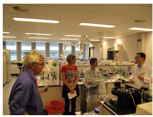
Device training CTCTrap members at Twente University.

CTC The development of the apheresis device for trapping circulating tumor cells (CTCTrap) from the blood circuit of cancer patients is nicely. LEUKOCARE progressing established a coating matrix (CTC Trap matrix) to couple EpCAM-specific capture molecules and demonstrated the binding and elution of cells derived from tumor cell lines expressing EpCAM under flow conditions. The CTCTrap device was down scaled to a bench scale size model to perform the cell binding and elution using realistic rheologic parameters. compatibility of the CTCTrap bench scale model with blood spiked with EpCAM positive cells was demonstrated. Next challenge is to upscale the device to clinical scale and assure safety and biocompatibility in preparation for testing on cancer patients.