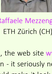
Raffaele Mezzenga ETH Zürich (CH)