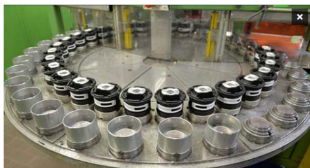
Production of hydromounts (Kreiszeitung, September 17, 2014)