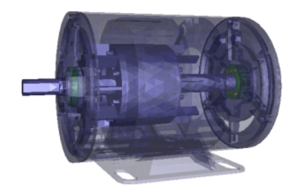
Figure 2 : Model of the electric motor

An electric motor is considered as shown in figure 2.