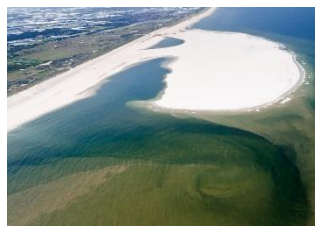
Figure 1: A picture of the Sand Motor after completion in September 2011

This research shows that it is possible to implement a forced coastline by hydrodynamics, beach armouring and multidirectional wind in the DUBEVEG model, but improvements can be made in future research. The DUBEVEG model in the current form is not applicable for the out-of-equilibrium anthropogenic shores like the Sand Motor because processes are missing. However, including multidirectional wind (aeolian transport directions) and beach armouring in the model result in a better approach to the observed dunes. Assumed is that improvements in these processes would further increase the approach of the observed dune patterns and increase the applicability of the DUBEVEG model for out-of-equilibrium anthropogenic shores.