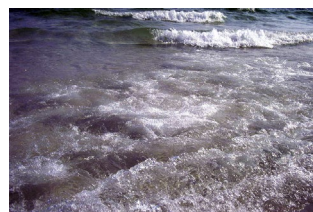
Figure 1: Example of figure (caption: Arial Narrow, 8 pt, italic).