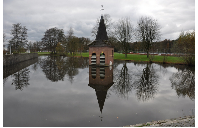
Figure 2: Reflections on liquid/gas interface, with ceramic body.