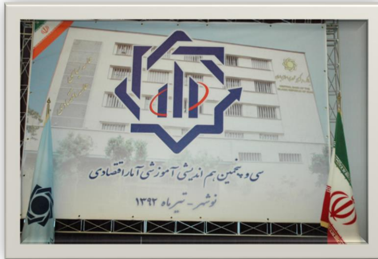
The International Year of Statistics logo is prominently displayed on the event banner.

Iran —The Central Bank of IRI added the Statistics2013 logo to its official calendars and other gifts given to its information sources. The organization also placed the Statistics2013 logo on its football team shirts! Team members are happy to report that in the annual football matches with the Central Bank General Offices, they won the final match and were awarded the big trophy!