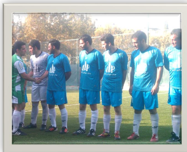
Central Bank of IRI football team members show off their sporty Statistics2013 jerseys.

Iran —The Central Bank of IRI added the Statistics2013 logo to its official calendars and other gifts given to its information sources. The organization also placed the Statistics2013 logo on its football team shirts! Team members are happy to report that in the annual football matches with the Central Bank General Offices, they won the final match and were awarded the big trophy!