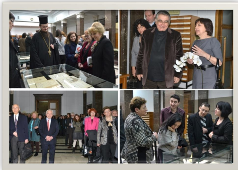
A montage of photos from the opening of the National Statistical Institute's (NSI) "Bulgaria and the world in figures" exhibition.

Bulgaria —On March 14 at the St. Cyril Methodius National Library, National Statistical Institute (NSI) President Reneta Indjova Ph.D. opened an exhibition titled "Bulgaria and the world in figures." Organized by the NSI and the National Library, the exhibition is part of the NSI's events to celebrate the Statistics2013 and its own 133rd anniversary. The exhibition is open at the National Library until April 15 after which it will travel to several cities across the country.