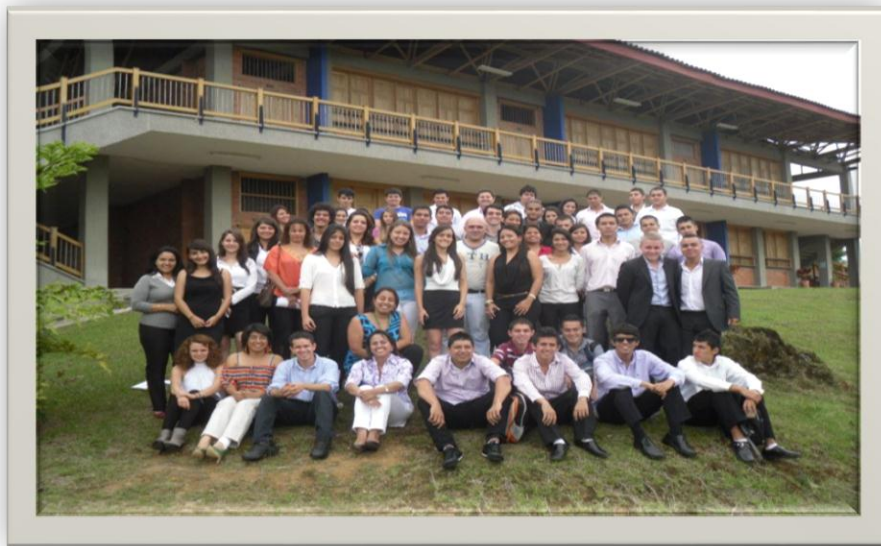
Students and instructors of the Agroindustrial Engineering Academic Program at the University La Gran Colombia campus in La Santa María.