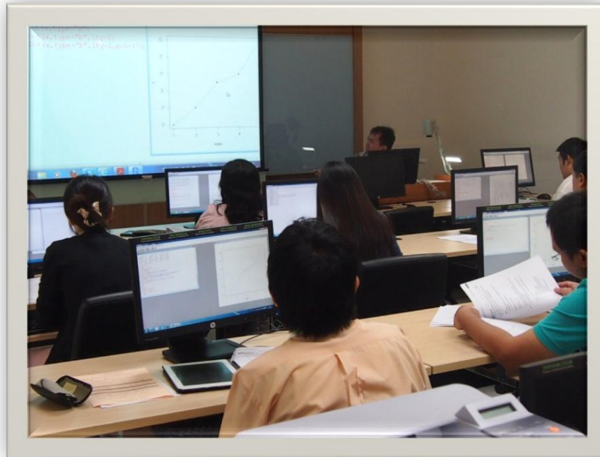
Participants listen intently at the free R and SAS training sessions at Thammasat University.

Thailand — As part of the International Year of Statistics, professors of the Department of Mathematics and Statistics at Thammasat University held free R and SAS training sessions on February 23 and 25 at the Rangsit Campus. More than 80 participants—alumni, undergrad students and faculty members—spent six hours each day improving their skills using each software. Participant feedback was positive.