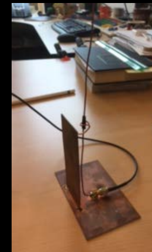
Receiver (optional or M7 Fields and waves)