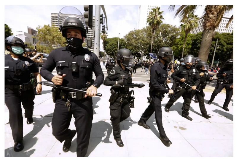
▲ Los Angeles police officers survey a protest in downtown Los Angeles on 14 August

An internal police chief memo shows employees were directed to use 'field interview cards' which would then be reviewed