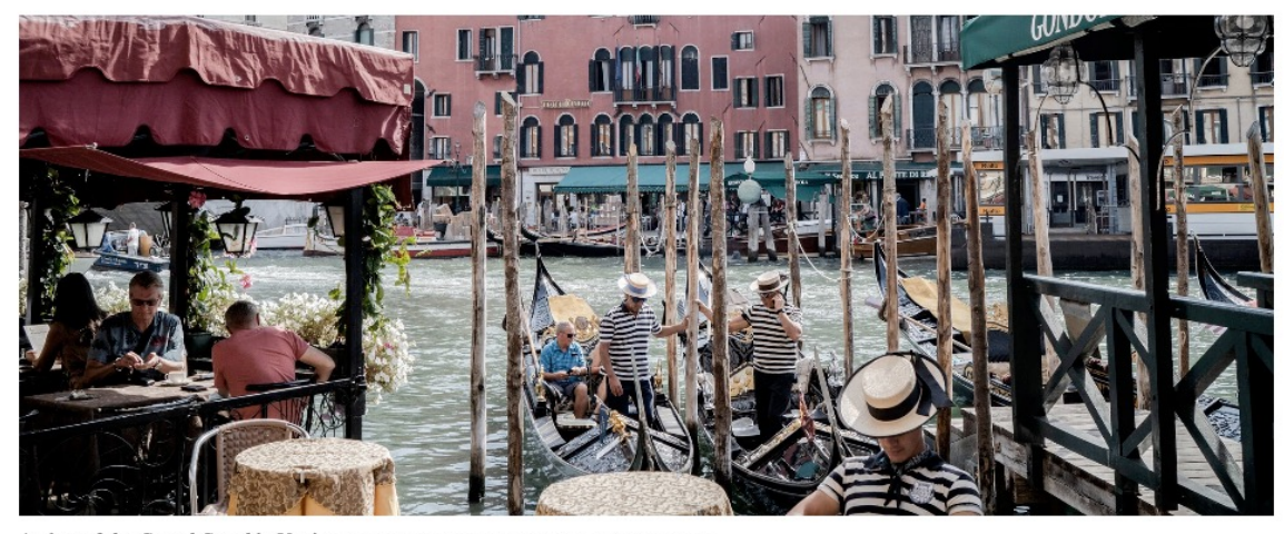
A view of the Grand Canal in Venice.