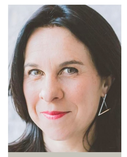
My City, My Life Valérie Plante, Mayor of Montréal