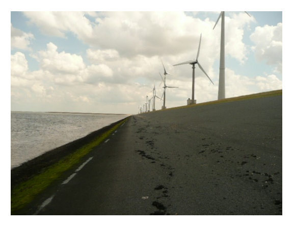
Figure 1: Dikes along a sea side

In this study, numerical discrete element simulations are conducted to estimate the mechanical behavior of dikes made of asphalt. To calibrate and validate numerical models, experimental samples are prepared for some element tests for asphalt and subsoil separately and together. The numerically observed mechanical response of asphalt together with subsoil is then further studied through an other numerical modeling approach (FEM). This research is in collaboration between UTwente, TU Delft and Deltares.