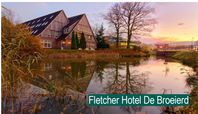
Fletcher Hotel De Broeierd