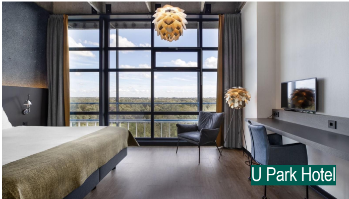
U Park Hotel