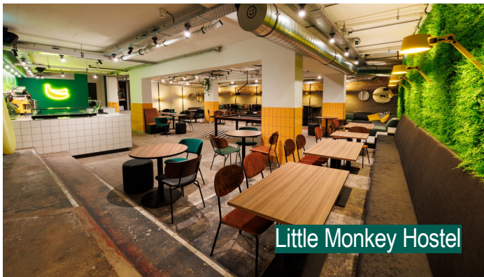
Little Monkey Hostel