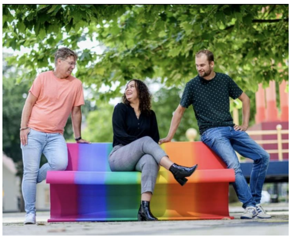
Learning community D&I