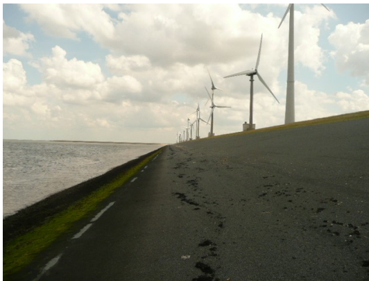
Figure 1: Dikes along a sea side

This research is in collaboration between UTwente , TU Delft and Deltares .