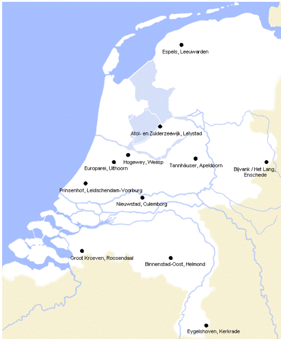
Figure 2: Geographical locations of cases studied in the Netherlands.

This section presents the results of the comparative analysis. We have chosen to present the results in stages. First of all we present an overview using descriptive statistics involving means, extremes, range, standard deviations and skewness of distribution. Furthermore, important data are presented per case in an inter-case matrix. The results of the multiple regression analysis are presented thereafter. To start the overview of the results, a geographic map of The Netherlands is presented in figure 2, showing the locations of the sites studied.