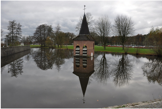
Figure 3: Reflections on liquid/gas interface, with ceramic body.