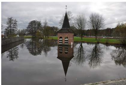
Figure 4: Reflections on liquid/gas interface, still with ceramic body, but now from farther away.